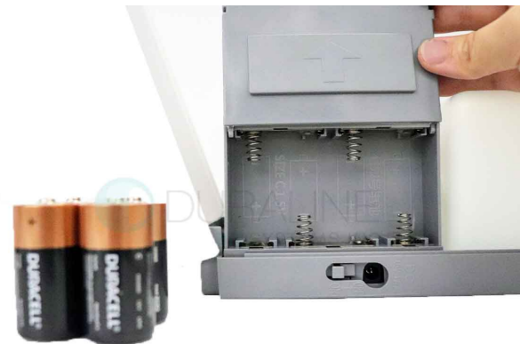
STEP 4 Insert the Batteries or Plug in the Cord