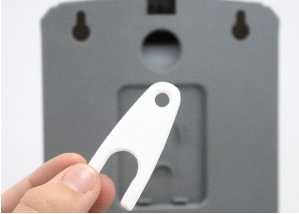
STEP 1 Find key in the back of Hand Sanitizer