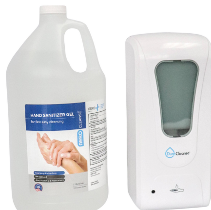
STEP 6 Keep refilling with Aerocleanse Hand Sanitizer and you are done!