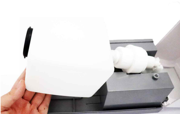
STEP 3 Refill the bottle with Hand Sanitizer