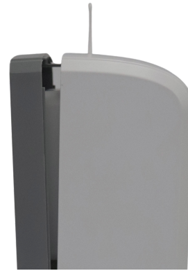
STEP 2 Pop it open by pushing in the key