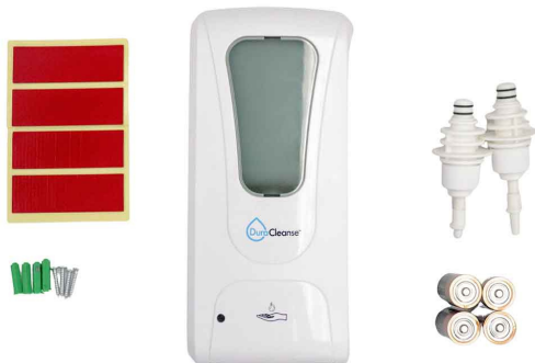
STEP 5 Use double-sided adhesive or screw to the wall