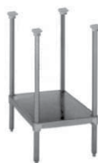
95-6060 S/S Stand