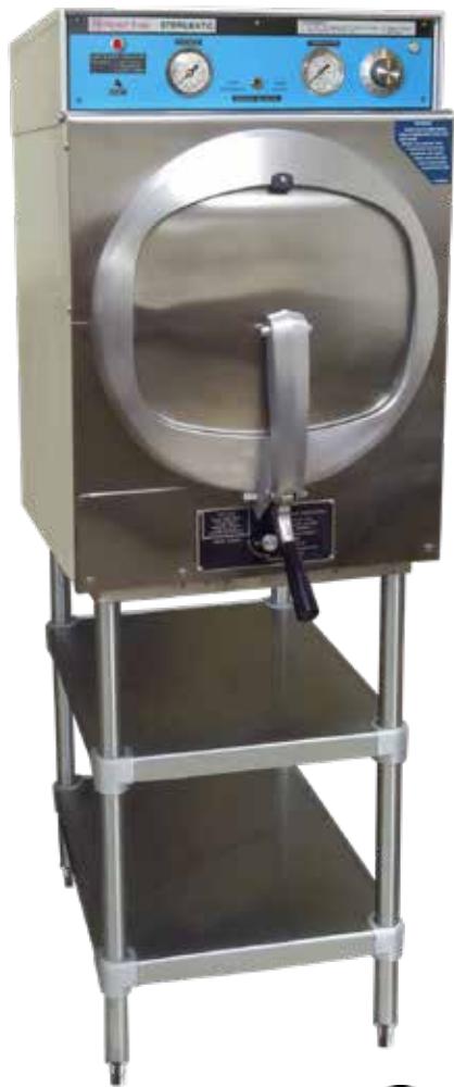
Shown on optional stand 95-6060