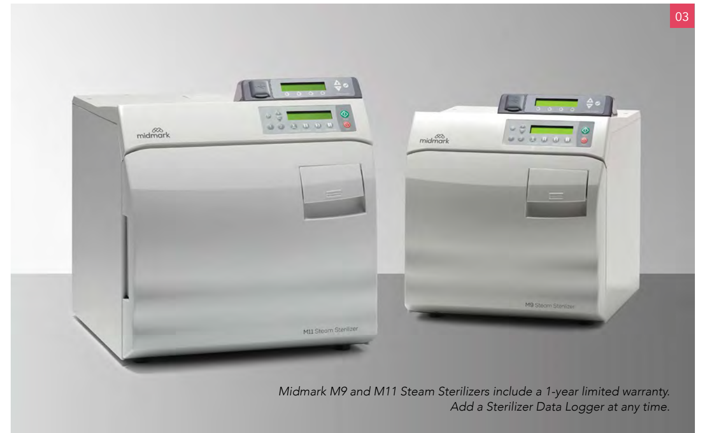
Midmark M9 and M11 Steam Sterilizers include a 1-year limited warranty. Add a Sterilizer Data Logger at any time.

01 Midmark sterilizers require no additional air or water filtration accessories or expensive daily Bowie-Dick tests. They cost only pennies per day to maintain compared to the dollars per day required by other units.