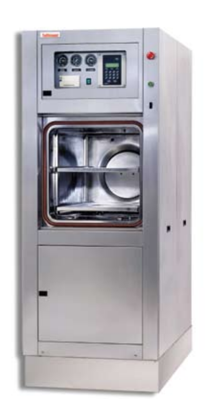
Vertical Sliding Door