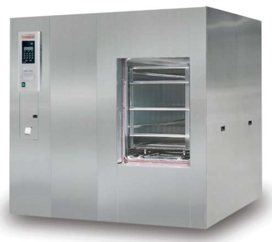
Horizontal Sliding Door