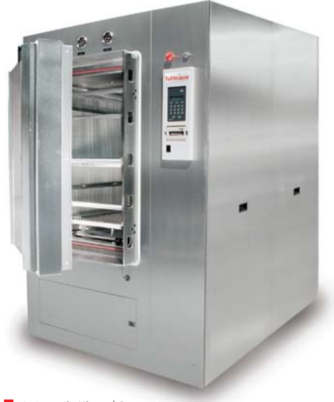
Automatic Hinged Door